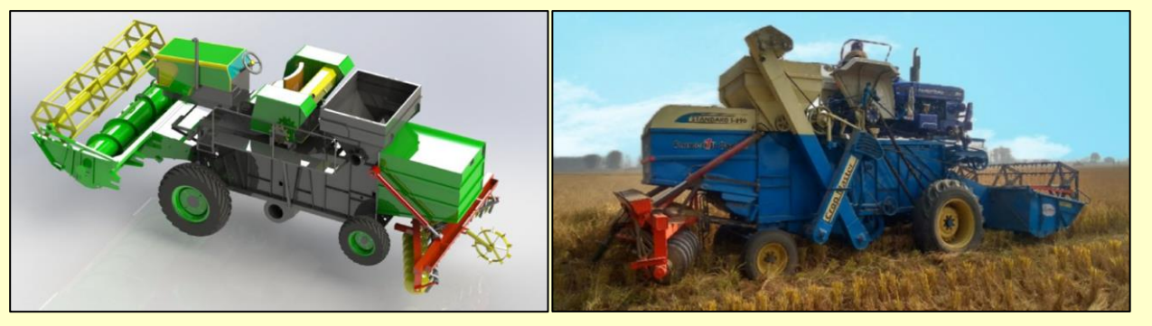
Figure 1 CAD model and field evaluation of developed seeding attachment

There are several types of furrow openers are found to be usefull for working in different soil conditions. Therefore, to obtain the best suited furrow opener for developing seeding attachment three different furrow opener (i.e. concave disc, double disc and punch hole) were evaluated into the rice stubble fields. From the performance evaluation of furrow opener, the concave disc was selected. The seeding attachment consisted of two gangs of concave disc at an angle of 23° from the direction of travel with the spacing of 225 mm. The seeding attachment comprises of a triangular main frame covering overall seeding width of 3100 mm. A fluted roller metering mechanism was used to meter the seed and fertilizer with the help of a chain and sprocket-driven ground wheel arrengment. Two hydraulic cylinders were installed with the frame of the combine harvester for smoothly lifting and down the seeding attachment while operating. The seeding attachment was supported with two lower link arrangements provided at the rear axle of the combine harvester. A 60 hp tractor mounted combine harvester was used to evaluate the performance of sowing of wheat while harvesting of rice crop at three different combinations of forward speeds and stubble heights (Fig 1).